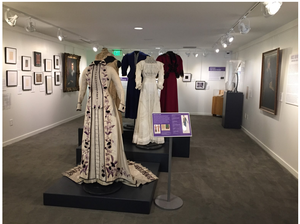
Photograph of exhibit area.

Unfortunately, it was during the week leading up to our exhibit opening that COVID-19 became a pandemic and hit Kentucky, forcing us to cancel our exhibit opening. It's also a bit ironic that “Venturing into the Public Sphere” would now have to wait to have its public debut. While the last wall panels were being mounted, the curators quickly ventured into the digital sphere by creating an online exhibit. We are pleased to share the results of this effort to turn a massive exhibit featuring over 75 manuscript items, photographs, portraits, dresses, and artwork. We would like to now share the results of this effort to tell the amazing stories of these women from the Ohio Valley who took on new roles and ventured out into a new sphere.