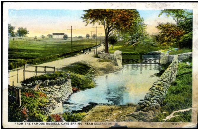
A Kentucky Spring University of Kentucky Libraries, Postcard Collection