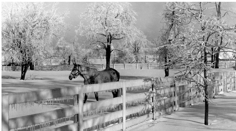
Horse in winter, 1948.