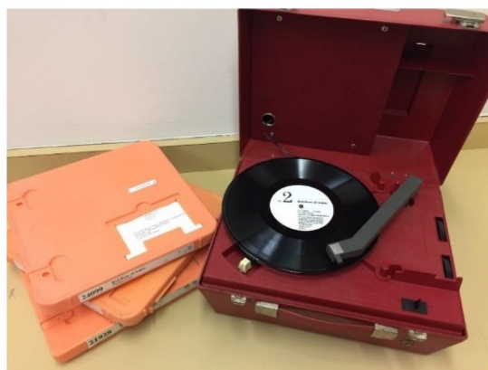
Analog formats from the Talking Library, KDLA.

Celebrate the 50th Anniversary of the Kentucky Talking Book Library by learning about Braille and analog formats. Read the December 2018 Newsletter and stay tuned for information regarding the anniversary event coming in April 2019.