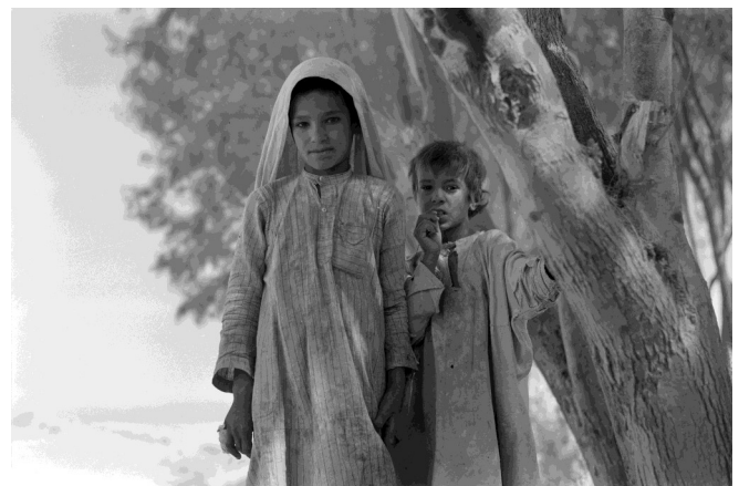
Top: People by food merchant, Sharqiyah, Saudi Arabia, 1947. SONJ 59176. Bottom: Farmer's children, Najd, Saudi Arabia, 1947. SONJ 58904, Standard Oil (New Jersey) Collection, Photographic Archives, University of Louisville, Louisville, Kentucky.