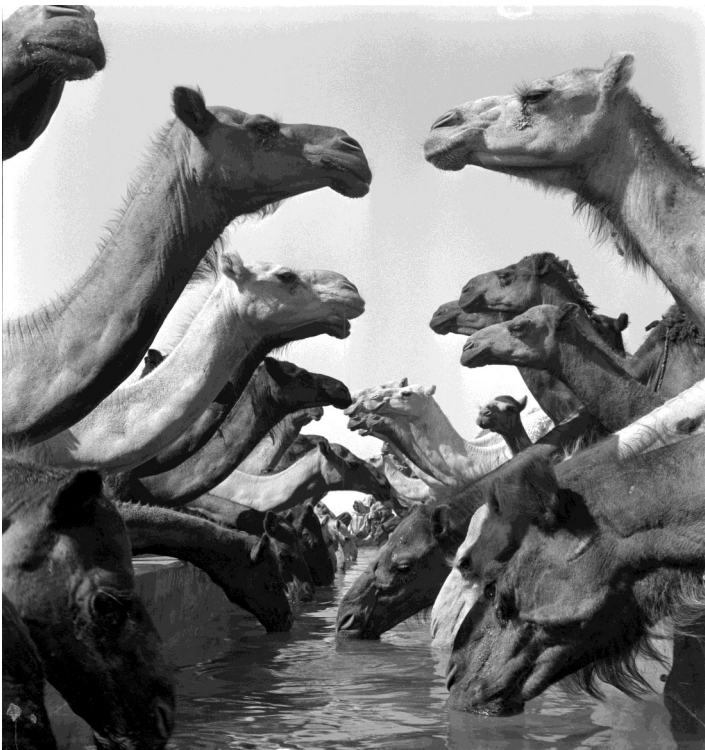
Camels drinking water, Jawf, Saudi Arabia, 1947. SONJ 58543, Standard Oil (New Jersey) Collection, Photographic Archives, University of Louisville, Louisville, Kentucky.

To view additional photographs from the Standard Oil (New Jersey) Collection visit: http://digital.library.louisville.edu/cdm/landingpage/collection/sonj/