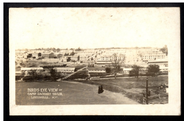
Bird's Eye View of Camp Zachary Taylor.