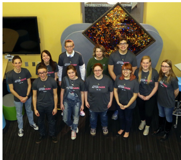
EKU Students who participated in Archives After

The student work, which included short stories, poetry, a painting, and more, will be published in April, and participants will have the opportunity to present on their work and experience during ECU's Scholars Week, April 9-13.