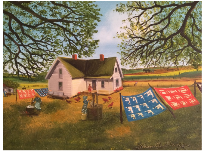
"Laundry Day," by Helen La France, no date. Filson Historical Society Museum Collection [2017.20]

The Filson Historical Society is pleased to announce our latest exhibits: What's Old is New at The Filson: Recent Acquisitions to the Collection and The Evolution of Camp Zachary . What's Old is New runs January 26-March 16, 2018. The Filson regularly receives historical material in all our collection areas: manuscript, book, photograph, print, and artifact. For the first time, a selection of recent acquisitions will be the focus of an exhibit. The Evolution of Camp Zachary Taylor runs January 26-July 27, 2018. In 1917, nearly three thousand acres of farmland and open fields were transformed into an active military camp with around two thousand buildings; four short years later the land, buildings, and equipment were auctioned off, and the Camp Taylor neighborhood was born. Images, documents, maps, and artifacts from the Filson's collection illustrate the history of Camp Zachary Taylor, Louisville's World War I cantonment.