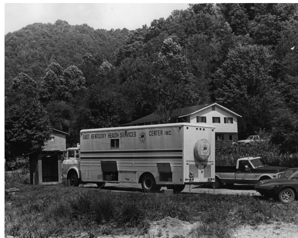
Eastern Kentucky Health Services Mobile Clinic, n.d.

The Bert T. Combs Appalachian Collection at UK Libraries SCRC includes collections of resources from several areas of Appalachian life, culture and history, including materials related to the coal industry; community; education and literacy; the lumber industry; medicine and public health; oil and iron; the railroad industry; regional and economic development; social reform; and the War on Poverty.