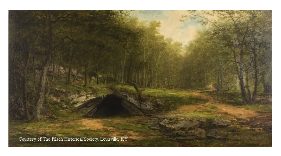
"Natural Entrance to Mammoth Cave," by Carolus Brenner ca 1890s.